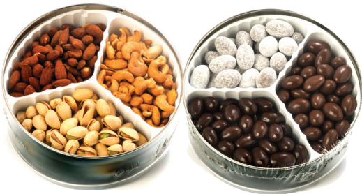
Assorted Nut Tin BHRTNT, BHRTCS