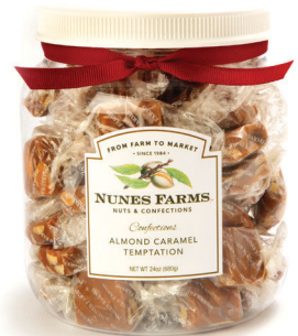
Caramel Temptation Jar CDJR