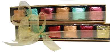
Chocolate Dipped Caramel Chews 04CD, NGACCX5-006, NGACCX5-012