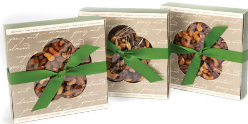
12 oz. Provincial Box PC12