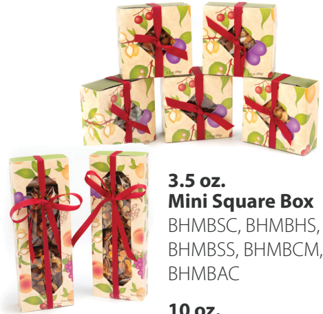
3.5 oz. Mini Square Box BHMBSC, BHMBHS, BHMBSS, BHMBMC, BHMBAC