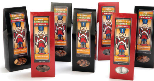
Nutcracker Totes & Trio available